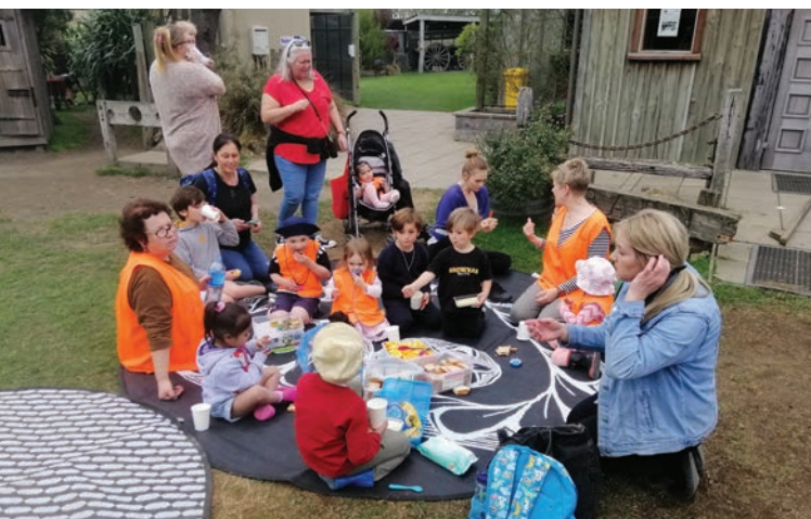
Karanga Mai Early Learning Centre on visit to Willowbank. Made possible by Stadium Cars.