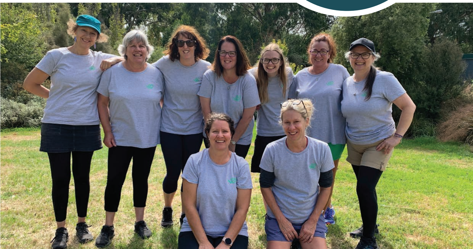
Community Wellbeing staff team

As a charity we rely on the support of local clubs like Rangiora Lions. THANK YOU from the bottom of our hearts.